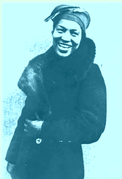
Zora Neale Hurston - January 7, 1891 (Nostasulga, Alabama) - January 28, 1960 (Fort Pierce, Florida)

Zora explored and understood all parts of her home state of Florida. She traveled its every mile gathering folktales. Mules and Men , a collection of Hurston's folklore from Florida, is rich in the magic of the natural world. The lyrical descriptions of settings, the realistic dialogue, and the haunting simplicity of symbols demonstrate her knowledge of real Florida. Zora sometimes characterizes the people of an area by the plants and animals around them. Regional plants and animals not only lend authenticity to settings and dialogue, they also provide a central symbol for each of her three Florida-based novels. Jonah's Gourd Vine is filled with snake imagery. In Their Eyes Were Watching God , often considered her finest literary achievement, the central symbol is a pear tree. A large mulberry tree is the main image in Seraph on the Swanee . In Their Eyes Were Watching God , Zora also includes the most calamitous natural disaster in modern Florida history: the drowning of more than a thousand people on the south shore of Lake Okechobee during the devastating 1928 hurricane.